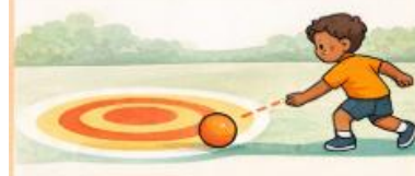
Roll a ball to a large target

I can roll a ball to a large target. Look at where you are rolling a ball. Push the ball along the floor.