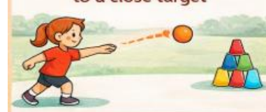
Throw a ball underarm to a close target

I can throw a ball underarm to a close target. Look at the target. Swing your arm under when you throw.