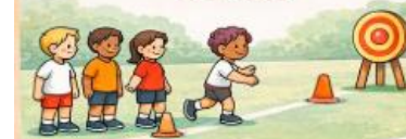
I can take turns and play by the rules

I can take turns and play by the rules. Wait for your turn. Remember to play safely.