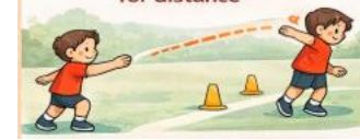
Try to throw a ball overarm for distance

I can try to throw a ball overarm for distance. Look at the target. Swing your arm back to throw overarm.