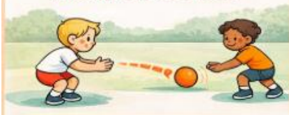
Try to catch a ball when it is rolled to me

I can try to catch a ball when it is rolled to me. Keep your feet apart and your hands out. Watch the ball as you catch it.