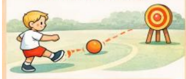
Kick a ball at a target

I can kick a ball at a target. Step forward with the opposite foot. Kick the ball to make it roll.